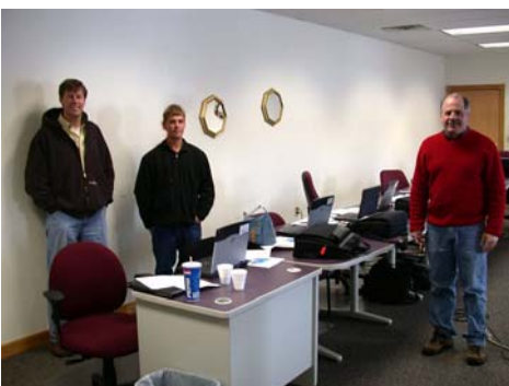
United States Department of Agriculture staff works together with Michigan Works!

out how we can help with your company's workforce development needs toll free at 1-800-MI-WORKS!