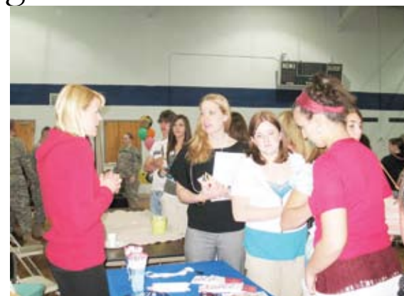
Michigan Works! Human Resource Specialists shared career path tools and resources with students.

Businesses represented at the networking breakfast commented on the students' involvement and interest in the three career paths presented.