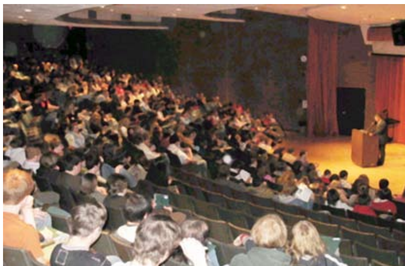
Over 900 students and 130 presenters participated in this year's event.

The second annual Pathways to Your Future-Career Choices was held on the campus of Northern Michigan University on April 27th. The program sponsored jointly by NMU, Marquette-Alger Regional Educational Service Agency, and Lake Superior Partners in Education, involved over 900 high school juniors in the Marquette, Gwinn, Westwood, North Star Academy, Ishpeming, Negaunee, Republic-Michigamme, Superior Central, and Munising Schools.