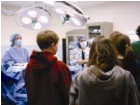
War Memorial Surgical Nurses explain "operating procedures" and the use of operating equipment to students.

included a summary of the occupation, potential earnings, education requirements and personal anecdote as to why the presenter chose the career. Information Services provided an overview of the tech-