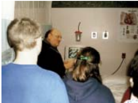
Students receive instruction on cardiac imaging while visiting the Upper Peninsula School of Cardio Sonography, housed at War Memorial Hospital.

Two hundred and fifty eighth graders from the Sault Ste. Marie Area School District participated in the first of two "Find Your Career Pathway at War Memorial Hospital" days. The students were given on-site exploration opportunities to explore careers in a healthcare setting.