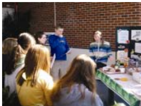
Dieticians provided examples of healthy meals, portion sizes, hospital food services and health requirements to these career explorers.

included a summary of the occupation, potential earnings, education requirements and personal anecdote as to why the presenter chose the career. Information Services provided an overview of the tech-