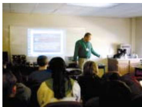
The Business Management and Marketing Technology Pathway requires knowledge of computer information systems relevant to the healthcare industry.

Hospital staff volunteered to develop presentations. Information