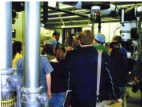
Eighth graders learn about career opportunities in Engineering/Industrial Pathway in a hospital setting.

While exploring the hospital students traveled the corridors and stairs to the "Chiller" and Boiler