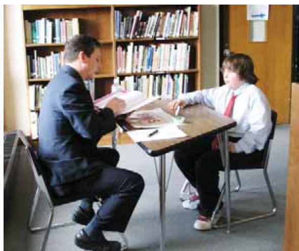
A Marquette Bothwell student pitches his business plan to a local professional in a recent interview session at the school.