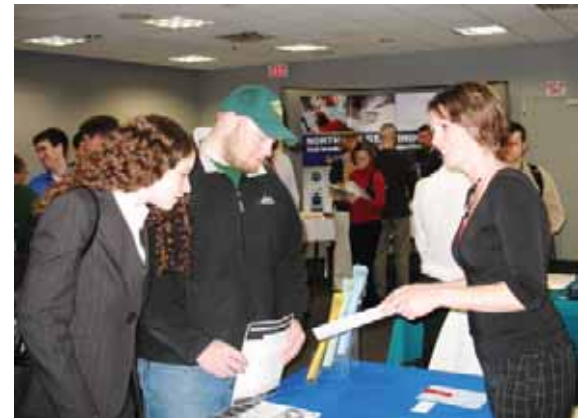
Approximately 500 students and 55 businesses participated in this year's Upper Great Lakes Collegiate Job Fair.

Approximately 500 students attended and came prepared with resumes for the various recruiters. Dale Stephenson and Carrie Zeleznik spoke to approximately 80-100 students about Michigan Works! services. Students were provided all types of information to assist them with their job search needs and were encouraged to come into our centers.