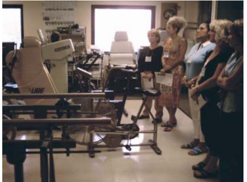
Delta Force visits Rehabilitation Center to learn about Physical and Occupational Therapy Career Opportunities.

in a hospital setting showcases the many career choices once can make if choosing a career in healthcare."