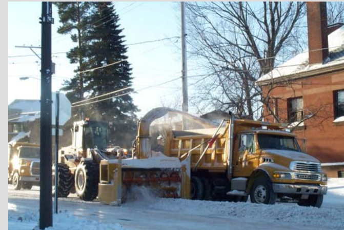
Snow Removal Equipment in Ironwood