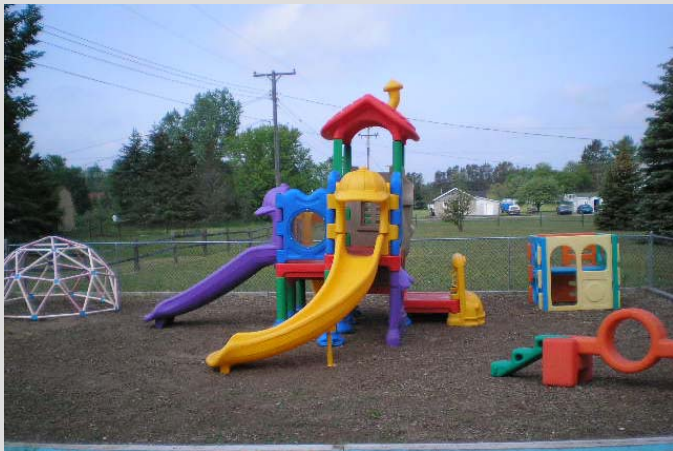
Childcare Grant to InterTribal Council