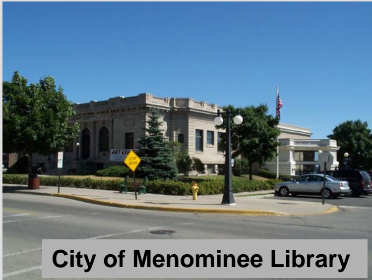
City of Menominee Library