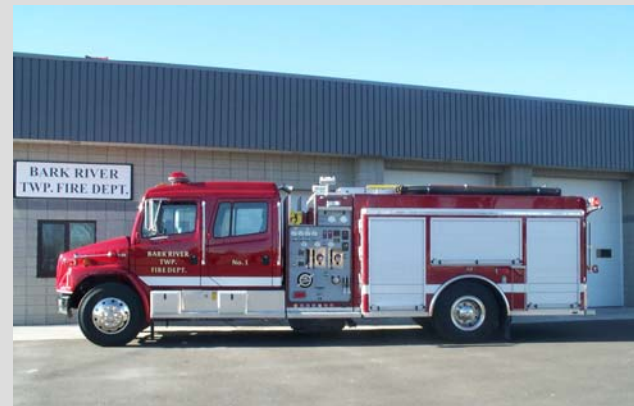
Bark River Fire Hall/Fire Truck