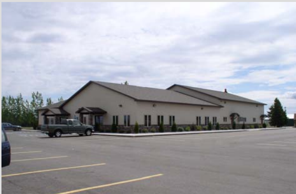
Rudyard Township Hall/Fire Hall