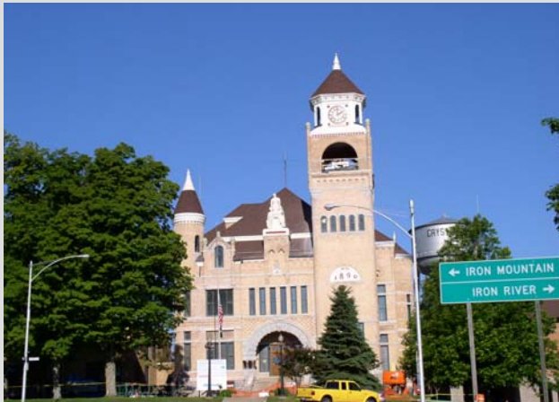
Renovation of Iron County Courthouse