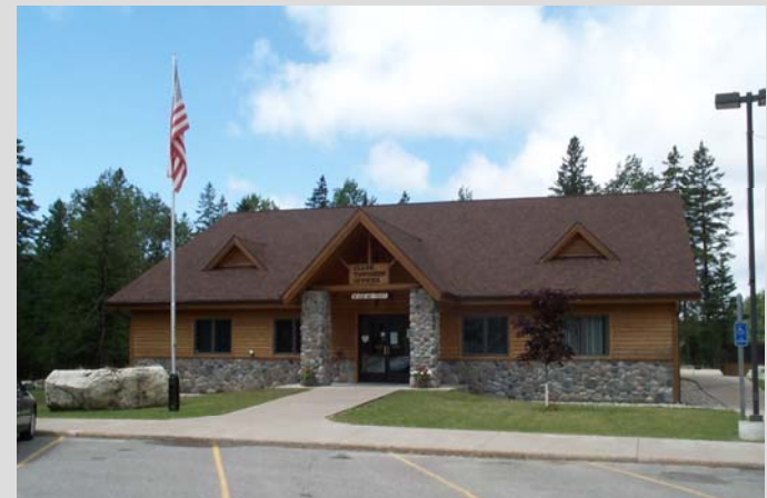
Clark Township Hall